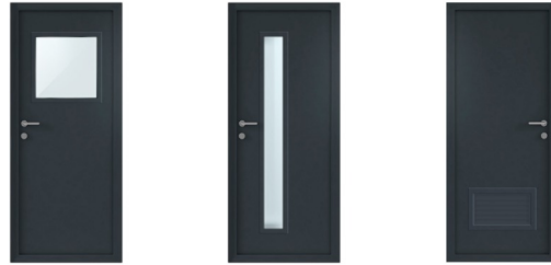
Square Vision Panel Window Double glass 400*400mm