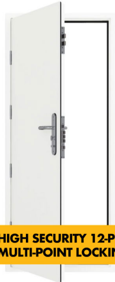
HIGH SECURITY 12-POINT MULTI-POINT LOCKING DOOR